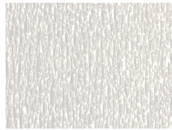
Embossed White | 85