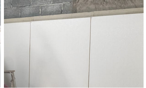
Glasbord® with Surfaseal® Sandwich Panels (Hygispan®)