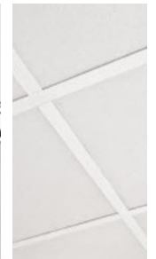
Suspended Ceiling Grid