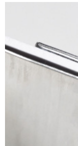
Stainless Steel Profiles