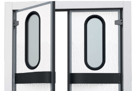
Custom Made Hygienic Doors (Hygidoor)