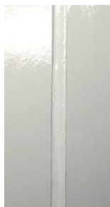
Polyurathane Seam Sealant