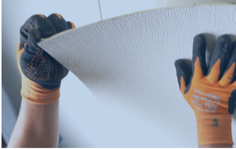
Glasbord® with Surfaseal® Self Adhesive peel and stick panels (Hygibreak®)