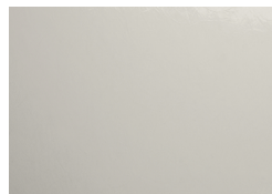
Smooth White | 85