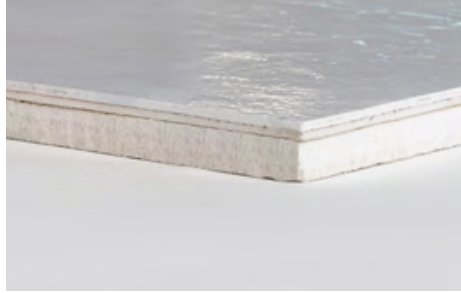
Glasbord® with Surfaseal® laminated on Rigid Board (Hygimat)